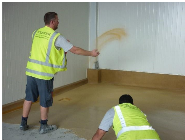
Applying the non-slip aggregate