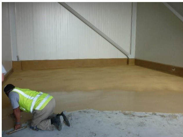
Installing one of the new Ucrete DP floors in Fonterra's newly expanded Takanini Plant