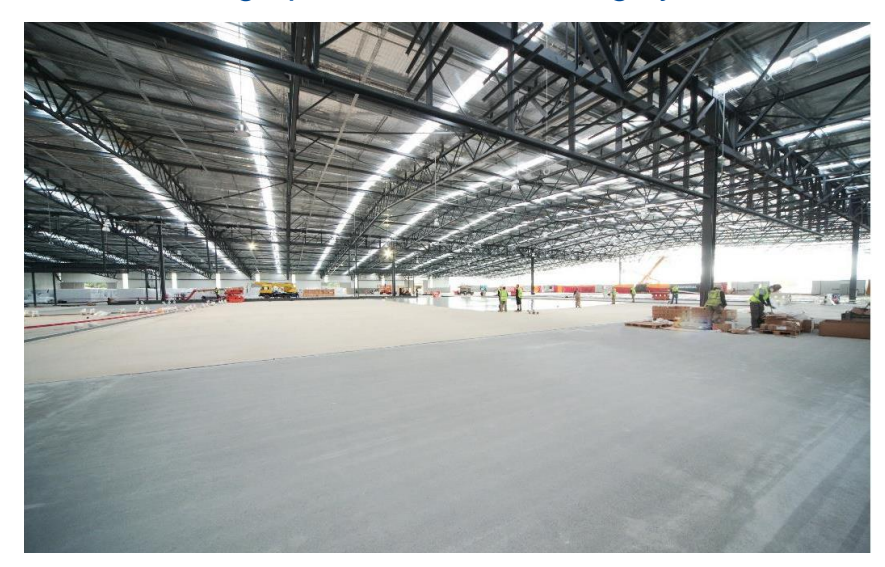
Lion Nathan East Tamaki Brewery

Ucrete DP high performance flooring system